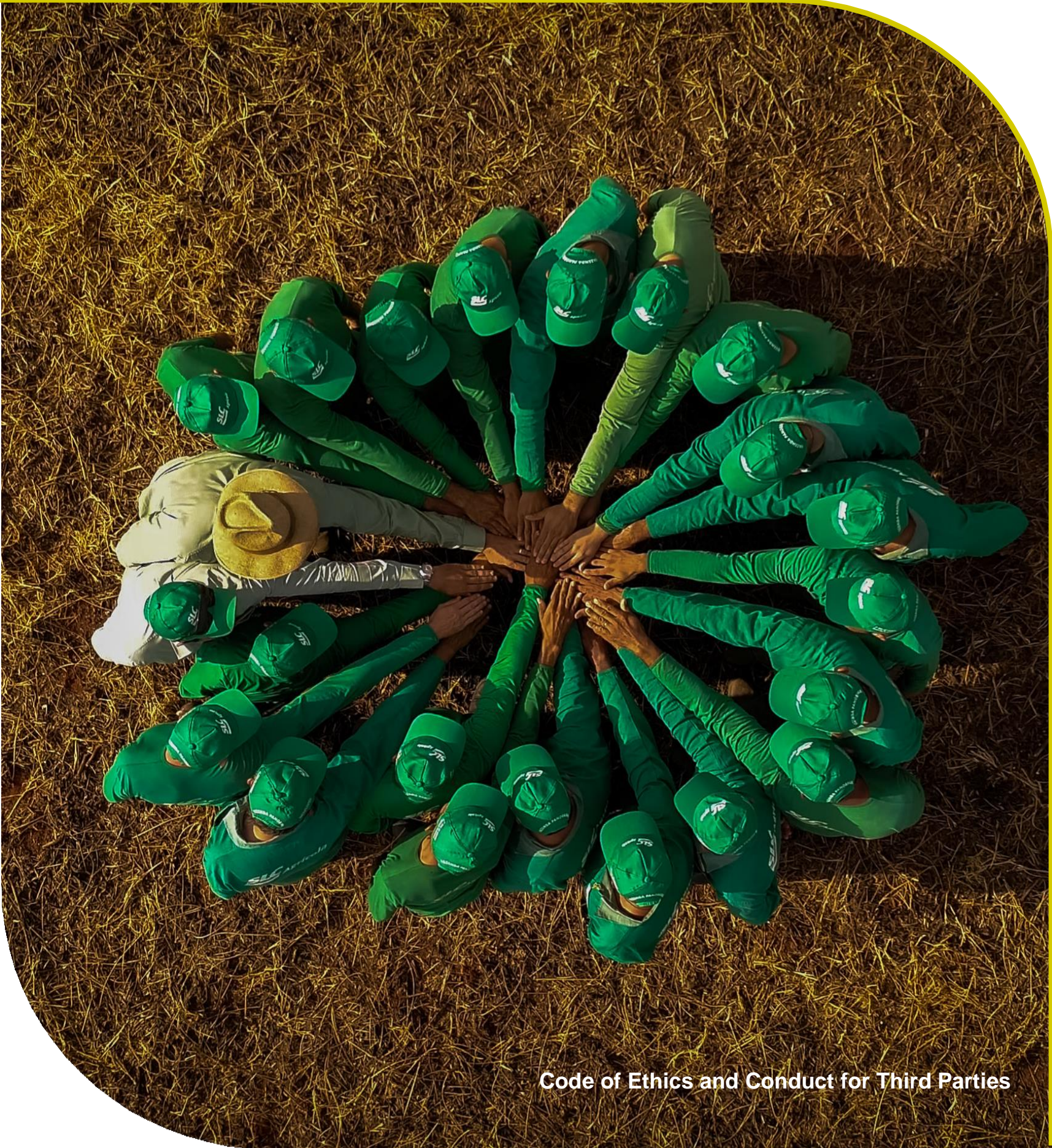
Code of Ethics and Conduct for Third Parties

We expect third parties and other stakeholders with whom we interact to act by observing the premises of this document and to extend these criteria to their entire value chain.